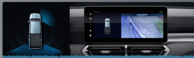
Astern image + right front blind area visible