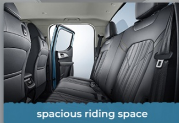
spacious riding space