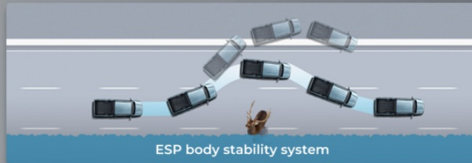
ESP body stability system